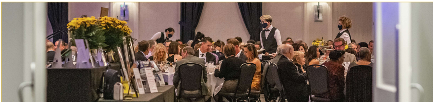
Dinner was served at last year's MTEF Tennis Ball at the Italian Community Center.

For detailed information or to sign up, visit mtef.com and click on the Events tab.