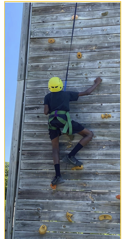
Rock climbing at RDC.

When asked what they thought of this new experience parents responded with comments such as: "They love it!" "My kids looked forward to it!" and "The chance to go to Rainbow was amazing and the kids begged to go back for second session because of it."