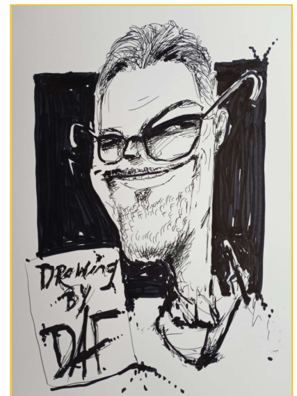
A self caricature by Dave Fliss.

As usual, the event will kick off with cocktails and hors d'oeuvres as guests mingle amid a display of silent Continued on Page 10