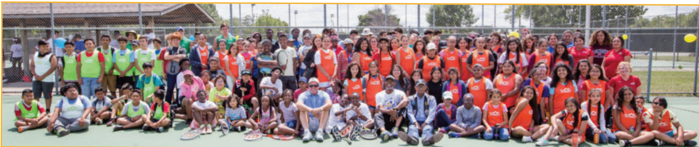
Participants and staff gathered for a photo at the 2018 MTEF/NJTL Rally.